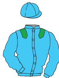
Lot 8. LIGHT BLUE, EMERALD GREEN epaulets

There is a public viewing of the silks at Doncaster Bloodstock Sales Ltd on Thursday 8th and Friday 9th September