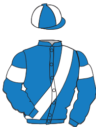
Lot 1. ROYAL BLUE, WHITE sash and armlets, quartered cap