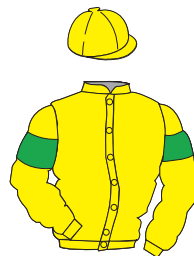
Lot 3. YELLOW, LIGHT GREEN armlets