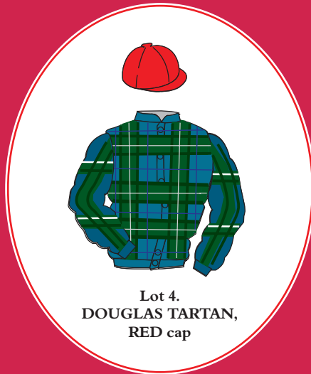
Lot 4. DOUGLAS TARTAN, RED cap

After racing at Doncaster Bloodstock Sales Ltd