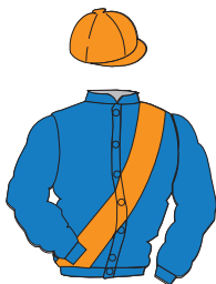
Lot 6. ROYAL BLUE, ORANGE sash and cap