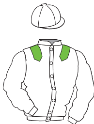
Lot 2. WHITE, LIGHT GREEN epaulets