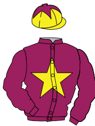
Lot 5. MAROON, YELLOW star, YELLOW cap, MAROON Star