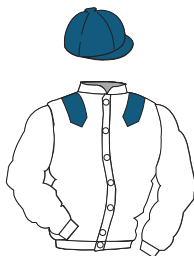
Lot 7. WHITE, DARK BLUE epaulets, DARK BLUE cap