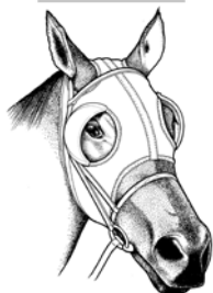
SHEEPSKIN CHEEK PIECES